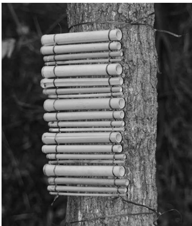
Fig. 1. "Curtain type" trap nest used in the study.

1) Total number of tubes examined was 180 from nine trap nests except in O4 (100 tubes) where four traps were lost before recovery. 2) For the stands older than 100 years old, only approximate ages are given because official logging records are not available.